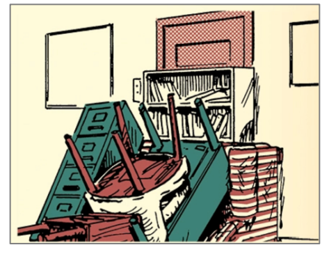
Stack furniture in front (or place in a line from the door to the opposing wall, if time permits)