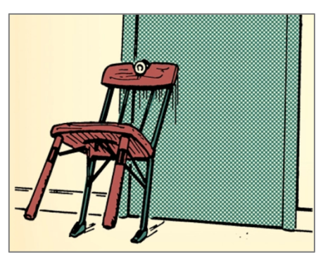
Place a chair under the handle.